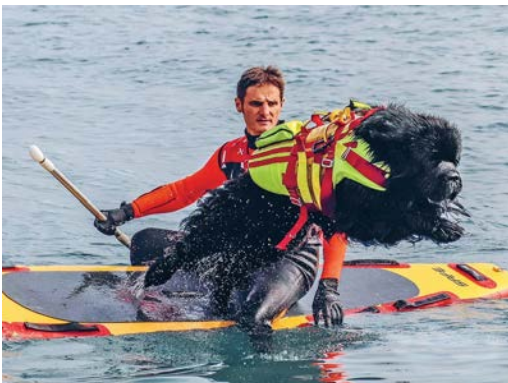
50 Good News Stories From Around the World That Will Brighten Your Day, Readers Digest, 21 Dec. 2021, https://www.readersdigest.ca/culture/good-news-stories-world/ . Accessed 27 Feb. 2022.