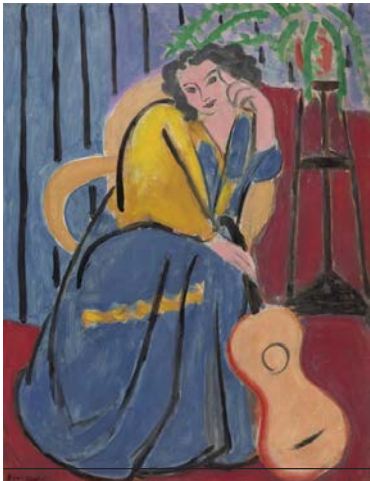
Henri Matisse, Girl in Yellow and Blue with Guitar, 1929, oil on canvas, The Art Institute of Chicago, Beardsley McCormick Estate, 2007-200.

Beginning Sunday, October 10th, patrons at the Jewish Museum can trace the timelines of art objects from one set of hands or venues to another throughout the era of World War II. For General Admissions tickets, click this link .